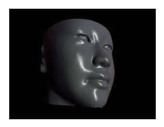
Figure 3: Synthesized face image.