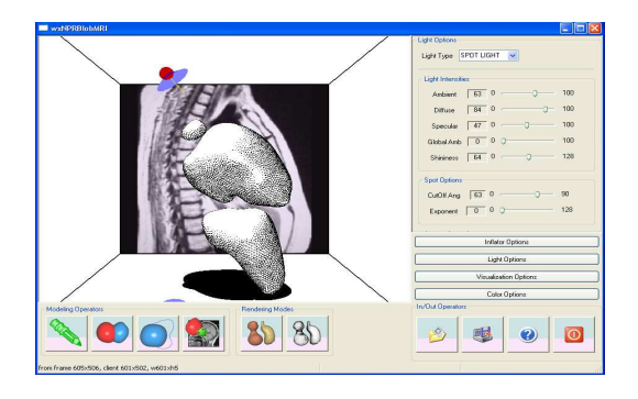
Figure 1: System overview.

The system is to be used with advanced pointing devices such as a TabletPC or stylus based tablet since most of user interaction is based on sketches both to create and edit 3D shapes. TabletPCs are more appealing for the target user since this enable ready communicating with other users while offering mobility and a familiar interaction similar to the pencil-paper metaphor.