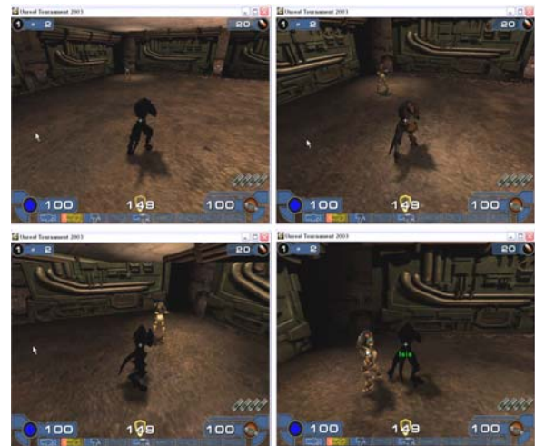
Figure 2: ELE interfaced with Unreal

enter the level, they begin "scanning" the room for an enemy. According to our observations, players often oscillate around an enemy as if he/she is invisible even though the enemy was in an open environment hidden by no obstacles or shadows. Using the timing data collected by the eye tracker, we identified a significant time lapse between players' eyes passing the character and recognizing the existence of the character. The results for the scene rendered using ELE show a considerable reduction in the players' 'scan' time. Hence, ELE, through careful placement of lights and choices of colors and angles, was able to improve visual attention and guide users to important areas in 3D scenes.