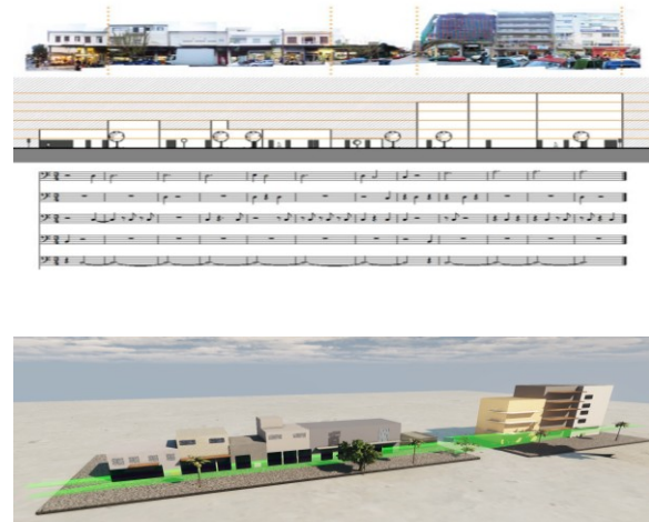
Figure 2. Translation of 1866 Square at Chania (Greece) to music