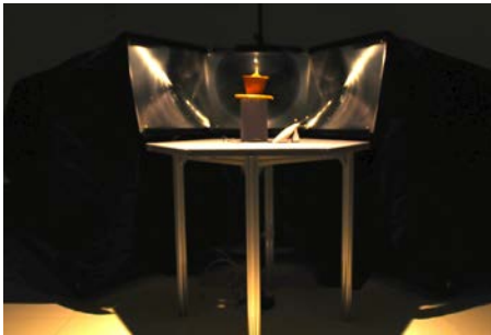
Figure 1: System Appearance