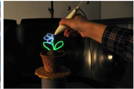
Figure 3: Drawing 3DCG (Flower) on the Real Object (Pot)