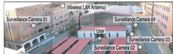
Figure.3: Outdoor field

Fig.3 shows our experiment field. When a user wants to improve geometric registration of mixed-reality on PDA display, he/she directs the PDA camera to one of the buildings near his/her location, frames its skyline at the PDA camera, and requests calibration process. (Before: Fig.2 left. After: Fig.2 right.) Once calibrated, it is not necessary to re-run calibration process until drift error of inertia sensor is accumulated. Fig.5 is a snapshot of PDA display overlaying a hidden area with a walker.