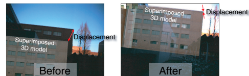
Figure.2: Calibration result.

The procedure of camera calibration is as follows. (1) Skyline area of PDA camera image is segmented. (2) Inside the area, distinct regions detected by image processing are selected as primary marker candidates. (3) Among all the primary markers in 3D building model database, visible ones are selected based on current status of pose estimation given by non-vision sensors. (4) Consider a pair of a visible primary marker and a primary marker candidate. Examine associated secondary markers to be found near predicted positions in PDA image. This prediction is calculated by fitting the visible marker to the primary marker candidate. If sufficient number of secondary markers is found, the pose and location of the PDA camera are calculated based on the pair.