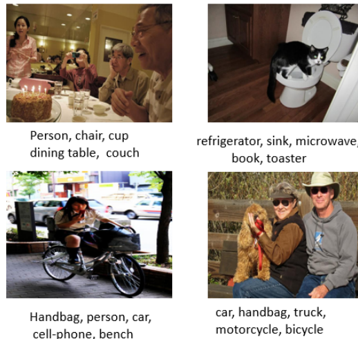
Figure 3: Qualitative Results: Column 1: Good, Column 2: Bad

Random baseline: Here we randomly guess 5 objects in an image.