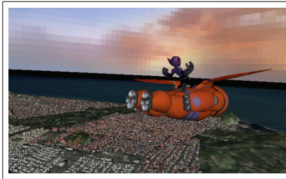
Fig 1: Nitro draws entire scene in real-time