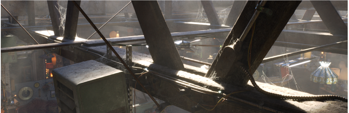
Figure 1: Antiques Store location from Pixar's Toy Story 4 ©Disney/Pixar.

David Luoh dluoh@pixar.com Pixar Animation Studios