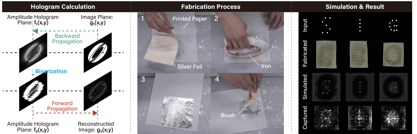
Figure 2: Left: designing an amplitude-modulated hologram. Center: fabrication flow. Right: results of our method (SIG letter).

Fig. 2), we achieved a faster and more economical method than that employed in a 3D printer. Wave propagation calculations were performed to design a binary amplitude hologram, and the designed hologram pattern was simulated. With the designed pattern, paper and silver foil were used to produce holographic structures, and their functions were confirmed with the experimental setup shown in Fig. 1.