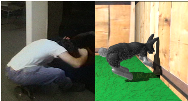
Illustration of student acting out scene and the transposed action on the three-dimensional character.

Beginning students, especially, need to be discouraged from spending all their energies learning to behave as the technology wants them to. Rather they must literally think outside the box and see the hardware and software as a production tool, not a creative tool.