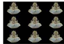
9-Tile Autostereoscopic Table Fountain Renderings