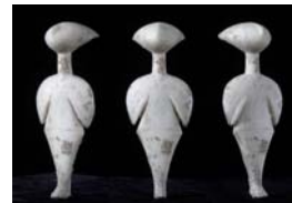
60° / 90° / 120° Images of Stargazer Statuette

This presentation outlines the technical and aesthetic challenges that went into creating these works.