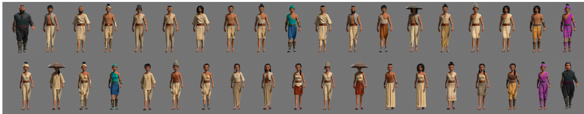
Figure 1: Lineup showing a subset of the diverse crowd combination variants prior to the addition of the final look treatment for clans.

Johann Francois Coetzee Walt Disney Animation Studios Burbank, USA