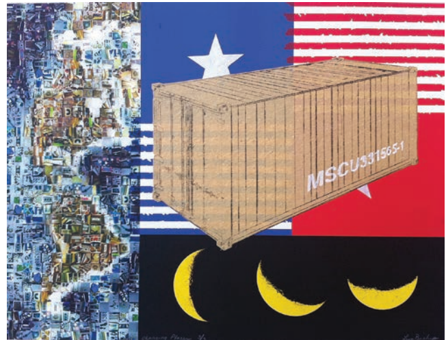
Lyn Bishop's "Changing Places" — pigment print on rag paper with monoprint / screenprint Chine-collé on kraft paper

The artists aim to share their love for the process of alternative digital fine art printmaking through discussions of collaboration, experimentation and following their intuition in their continued investigation of creating hybrid fine art prints.