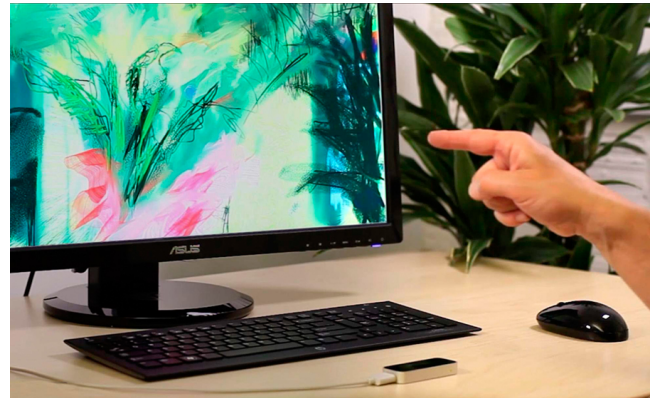
Figure 1. Air painting using the Leap Motion Controller and Corel Painter Freestyle.

In addition to addressing these questions, Jeremy will also share tips on air painting technique, including his approach to leaning in and out of the hover plane for fine brush control.