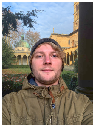
(b) Forward Selfie