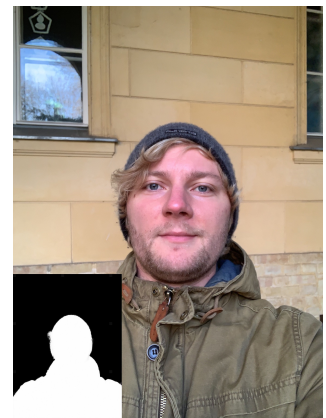
(d) Front Camera Image and Matte

Figure 1: Comparison of a common selfie captured using the front camera (a) and a forward selfie obtained by our mobile application (b). The forward selfie is obtained by blending the back camera image (c) with the simultaneously acquired front camera image using a person-specific matte (d) that is computed during capturing.