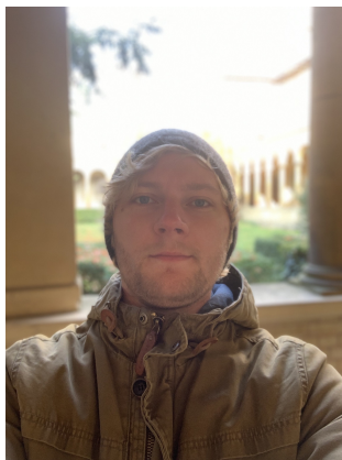
(a) Common Selfie