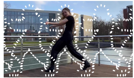
Figure 1: Results produced with MotionViz . Left: halos with neon glow, middle: single silhouette, right: twin-like outlines.