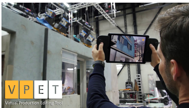
Figure 2: Real set and its virtual extension.

To match the virtual set extension with the real set, VPET's functionality had to be extended. Before loading or streaming the virtual scene to the client, the user has to specify an anchor point, e.g. an object corner. This is then used to match the position of virtual elements in the real world. The virtual set elements will be loaded and seamlessly integrated into the client's visualisation. All virtual elements can now be edited using the full VPET toolbox.