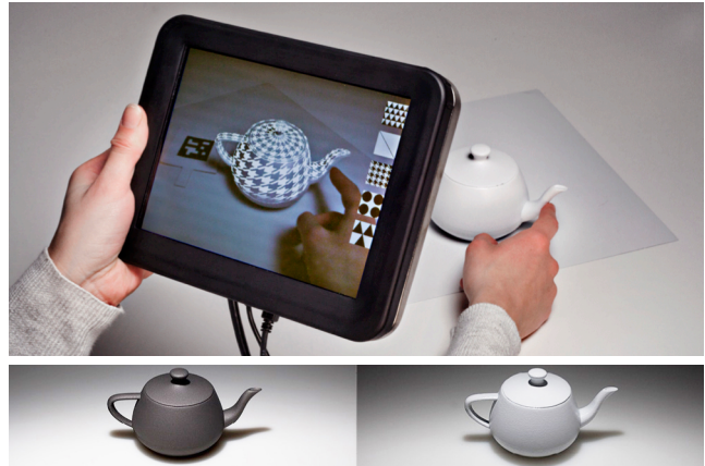
Figure 1: The user feels virtual tactile textures on a real object while observing them on an AR display. Note, that the object is not instrumented with any tactile actuation apparatus.

The REVEL tactile technology allows designing new and exciting AR experiences that are either difficult or impossible to create with existing tactile AR technologies, including interactive surfaces, video see-through AR (Figure 1) and tangible AR interfaces.