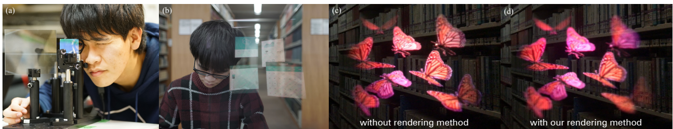
Figure 1: (a) Prototype display based on our optical schematics. (b) The obtained image from see-through prototype. (c), (d) The result of applying simulated retinal blur. Note that there is a difference between the image acquired by the camera and the image actually seen through the human eye.

Ippei Suzuki University of Tsukuba PixieDustTechnologies,Inc.