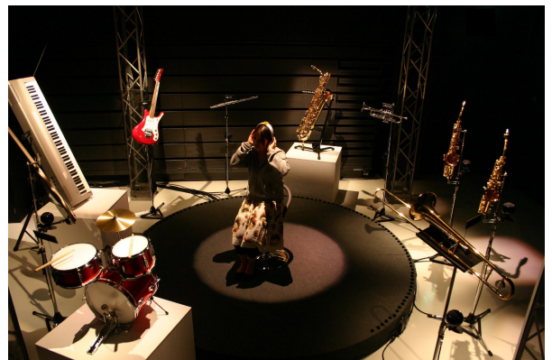
Figure 2: Lighting depending on each part's sound-level.

The Sound Scope Headphones enable the wearer to control an audio mixer through natural movements. We are now developing applications for the headphones. For example, Figure 2 shows real instruments where the light brightness is controlled depending on each part's sound-level. This allows the user to understand each part's sound-level visually as well as aurally. This should help musical novices who do not know the sound of each instrument learn the relationship between instrument and sound.