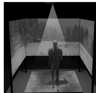
Figure 2: The floor, in the configuration in which it is installed in the rear-projected CAVE-like environment of our lab.

onto real snow. The latter simulation requires motion capture (via a Vicon MCam2 system) of the posture of the feet in order to render the footsteps.