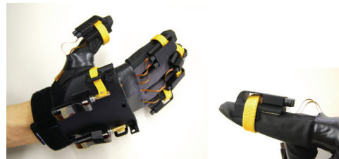
Figure 3: Prototype device and closeup of index finger

virtual objects [Minamizawa et al. 2007]. By reproducing the vertical and shearing forces on the fingerpad by this simple mechanism, the device could generate high-responsive and precise haptic interactions of the dynamic motion of the virtual objects. We extended this method to the entire hand including the palm, and also confirmed the effectiveness of bimanual coordination particularly in the perception of volume and surface.