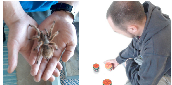
Figure 1: When designing the GlowBots we took inspiration from the relationship people develop with unusual pets such as spiders

We have also been systematically developing new design methods to see how users' interests can be transferred into novel design – in particular for robots [9]. In one case, we transferred the special relationship that some people have with unusual pets, such as snakes, lizards and spiders, to robot designs – but without transferring the anthropomorphic properties of these