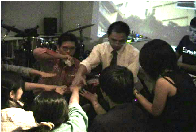
Figure 1: A Snapshot of a Live Performance with Freqtric Drums

Freqtric Drums is a device that turns audiences around a performer into drums. The performer, as a drummer, can communicate with audiences, as one set of drums (figure 1). The device requires human contact to conduct a signal that triggers drum sounds generated from MIDI through wires. Freqtric Drums has two types (figure 2). One is Freqtric Drums Live, which is designed for live performance. It has ring interface and sensor that is so sensitive and responsive in order to express drummers' performance to its most delicate nuances. Another is Freqtric Drums Home, which is designed for