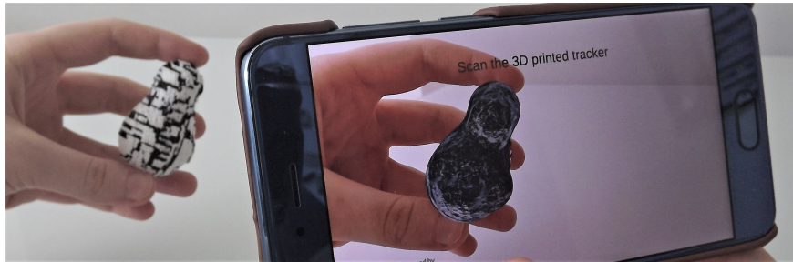
Figure 1: Functional implementation of MR with 3D printing for a new museum exhibition format

Oleg Fryazinov NCCA, Bournemouth University United Kingdom ofryazinov@bournemouth.ac.uk