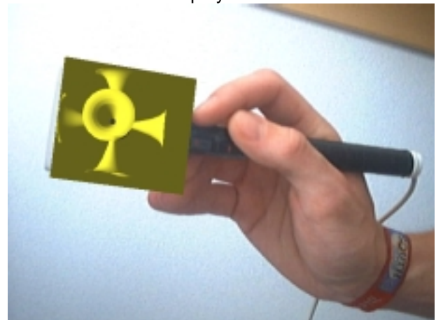
Figure 2: The ASR application allows a drag and drop of sound sources.

Current AR applications do not allow a direct manipulation of sound sources. ASR is the first prototype which combines sound and graphics in a AR environment and offers a wide spectrum for further applications. Especially in the authoring process for Augmented Reality applications it becomes difficult to place the sound sources using traditional 2D/3D based authoring tools. Now, the authors can place 3D sound sources in the real 3D space and they have a more intuitive experience how it really sounds. In the second application, which we are working on, the user can place virtual furniture in the room. This application will be combined with ASR, so that the user doesn't see the newly established room, but he also can hear how the radio or DVD player sounds.