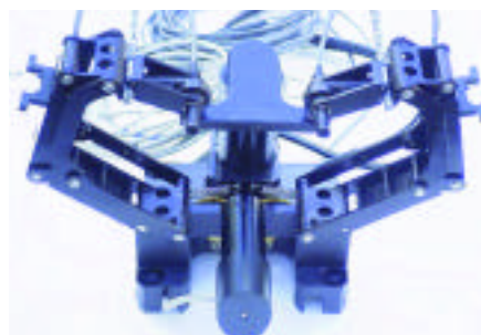
A prototype of a constant-orientation camera.