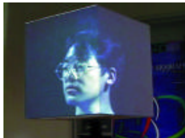
Projected image. Both the image and the cubic screen are controlled to follow the remote person's head motion.