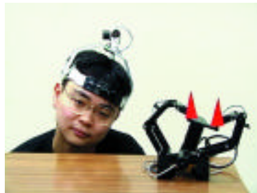
A constant-orientation camera with an operator.

the screen. X'tal Vision was demonstrated at SIGGRAPH 98 and SIGGRAPH 99. By extending the technology to telecommunication, X'tal Head allows users to observe a stereoscopic head image of a remote person. A head-tracked camera with a constant-orientation link captures the head image, and the system displays a novel, realistic "talking head."