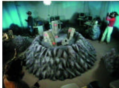
Physical game field