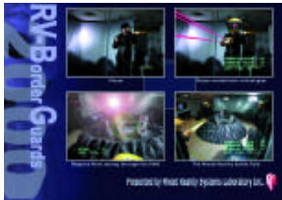
RV-Border Guards card