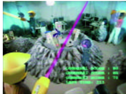
Bird's eye view of the RV-Border Guards space