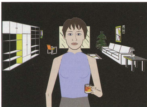
Figure 3. The Façade interactive dramatic world.